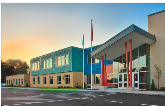
Final Exterior Image