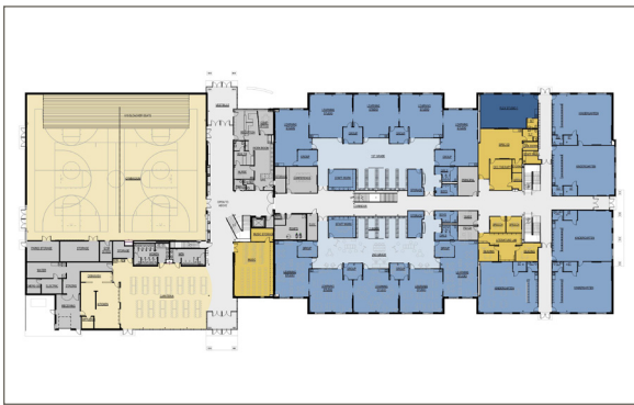
Preliminary Floor Plan