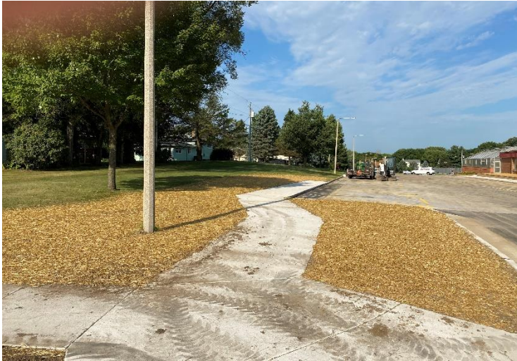
The photo above shows seeding just put in place south of New Badger Ridge. The image to the right shows the now finished landscaping just outside the greenhouse. In the photo below you can see new plants in a parking lot island outside New Badger Ridge. The image below and to the right showcases landscaping in a planter near the southwest parking lot.