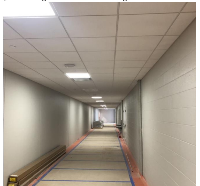
The casework continues throughout the school as the photo to the left shows a view into one for the project lead the way rooms with the new casework installed. Above is a view down a hallway in the fieldhouse as we continue to install ceiling grid and tile throughout the first floor!

QUESTIONS? Please contact Project Manager Aaron Zutz at 608.441.6891 or azutz@findorff.com