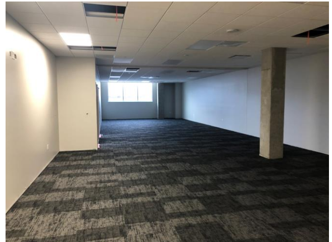
Above: The Carpet is installed in the Future heath rooms in the fieldhouse. The view to the left is the LAST precast panels being installed for the new high school.