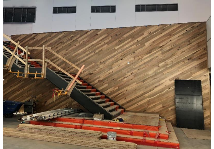
The wood processed from the site is being installed throughout the whole school! Above is a view of the monument stair going from the Atrium to the Café Mezzanine. Below is a view of one of the walls in the community pool where the wall tile has started to be installed.