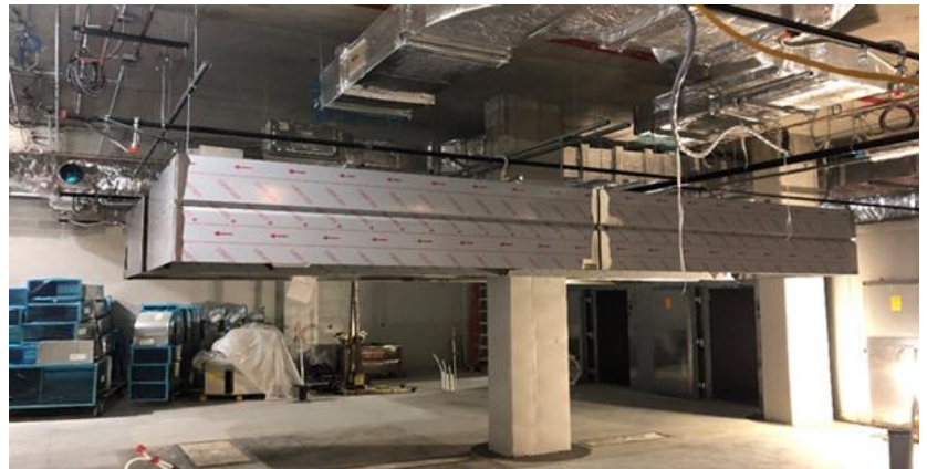
Top: A view from above shows the music area roof complete. Now only the pool area is left to finish for roofing! Below the top photo is an image of the kitchen hood that have been installed along with a view of the kitchen coolers. To the right is one of the sinks that were installed after the countertops were completed on the third floor.