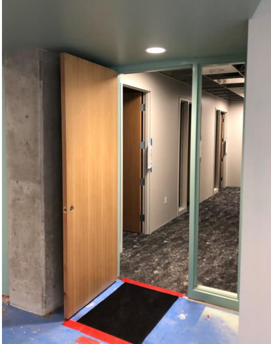
Above: Wood Doors and hardware are started install on the third floor. Each door comes with a unique hardware set that must be installed individually. Below is a view of a hallway on the second floor that was painted a vibrant yellow.