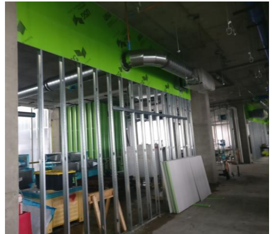
Left: The social stair is all ready to be poured on Monday as the rebar and the outlet boxes are installed. Above is a photo of the wall framing and duct work on the third floor. Left is a drone view of the front of the school and the completed sheathing.